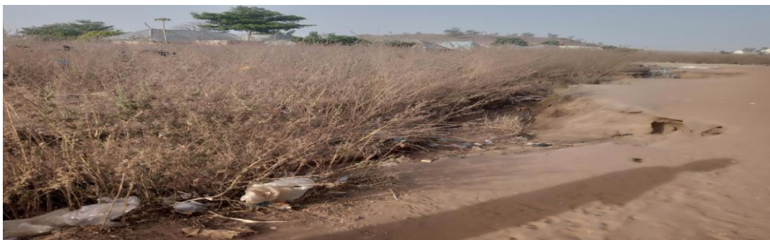
Figure 3: A damaged road beside UBE primary school, old Kwangwara (Site B)

2. Along Universal Basic Education (UBE) primary school at old kwangwara: This is site B, it is selected because the area is along a minor road surrounded by houses. The area is seen in figure 3; it is known to be vulnerable to erosion due to the local