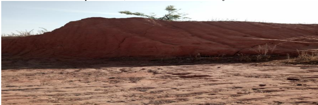
Figure 2: A Mud block industry behind AEDC (Site A)

1. Behind Abuja Electricity Distribution Corporation AEDC along Federal College of Education (FCE) road, in Kontagora: This is site A, in figure 2, it is selected because the site is used for molding of mud blocks and sand excavation during the rainy season. It is a rock formed as a result of accumulation of sand and stones. The red soil of the rock is clayey and very good for molding of blocks this is why human activities of this kind takes place there. During the rainy season the exposed soil is vulnerable to erosion and being excavated for sand filling eroded areas in the community. Human factor is the major cause.