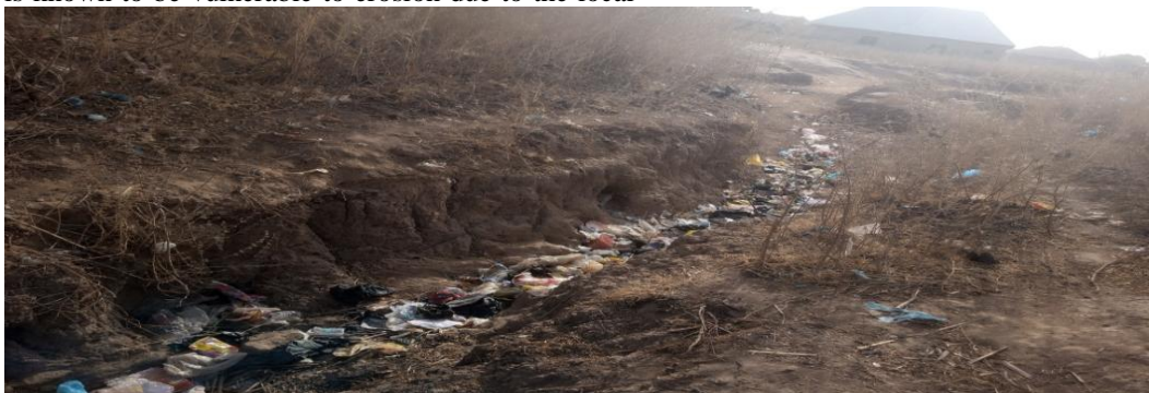
Figure 4: A damaged road beside FCE Kontagora fence (Site C)

geologic setting, the permeability, porosity, cohesion and hydrodynamic events in the area. The gully erosion menace is thriving as a result of absence of well-coordinated control measures and inadequate and urgent attention it deserves.