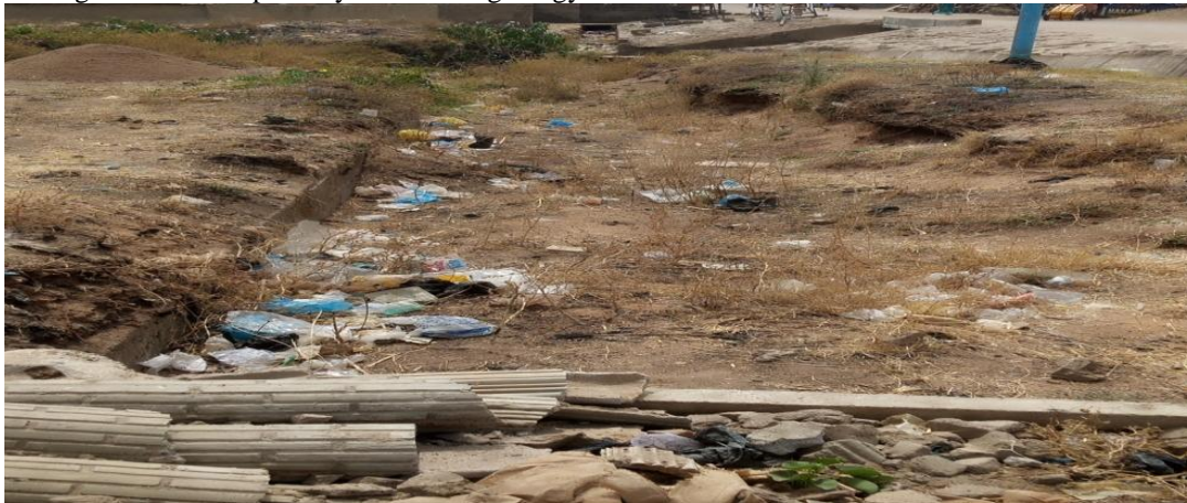
Figure 5: A modern block making industry with gully erosion behind old market (Site D)

off played significant role in gulling, runoff at vulnerable region where there is poor drainage shows elevation changes within valley slopes which is observed in this site.